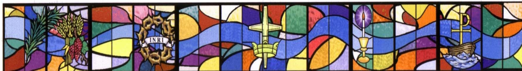
The last panels (north) depict the Passion and Easter themes and continue on with the candle representing Jesus' continuing presence as the Light of the world and the ship representing the Church in the world.

"Worship the Lord your God, and serve only him" (Matthew 4:10).